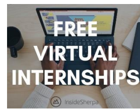
Virtual Internships with global companies