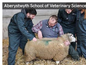
New Veterinary Science Degree collaboration with RVC