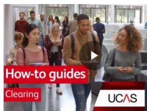
New Clearing Plus to offer more personalisation